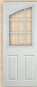
9 Lite Arch