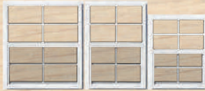
24" x 27" • 18" x 27" • 18" x 23"