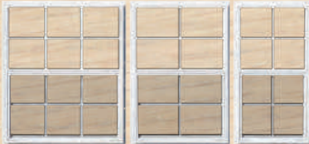
WHITE - 30" x 36" • 24" x 36" • 18" x 36"