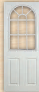
11 Lite Arch