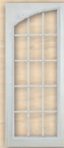
15 Lite Arch