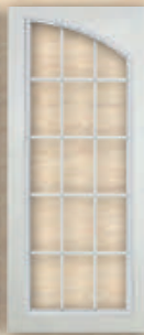
15 Lite Arch