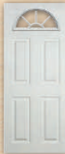
5 Lite Arch