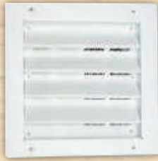
8" x 8" Gable Vent