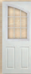
9 Lite Arch