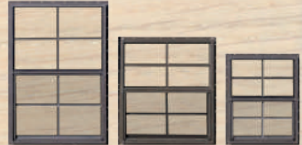
BROWN - 24" x 36" • 24" x 27" • 18" x 23"